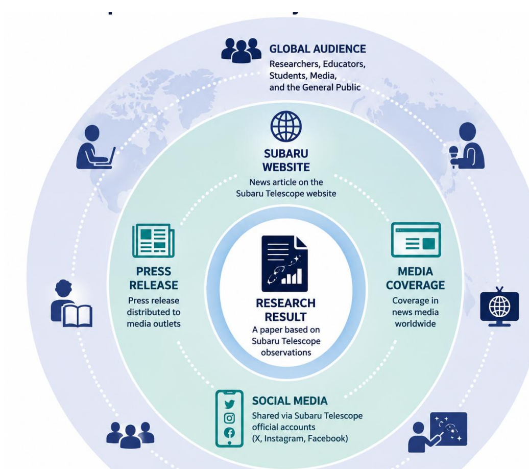
Share your Subaru discoveries with the world

The Public Information and Outreach (PIO) team at Subaru Telescope communicates scientific results from the Subaru Telescope through our website, social media channels, and press releases. If you are about to publish (or have published) a paper based on Subaru Telescope observations, we encourage you to consider announcing your results through Subaru Telescope and the NAOJ communication channels.